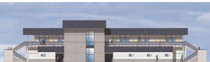
Field House architectural rendering