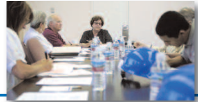
Oversight committee meeting

This three-story building will feature faculty offices, a multimedia center, open areas for part-time instructors, four suites for academic deans, a teleconferencing center and offices of the Citrus College Foundation, Office of External Relations and various student programs. Construction is approximately 90% complete with occupancy scheduled for April 2008.