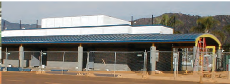
Field House and Concession Buildings (estimated completion summer 2009)