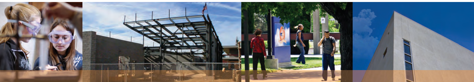
Vocational Technology Building (construction began December 2007)

Measure G was presented to voters under the provision of Proposition 39, stipulating that at least 55 percent of voters approve a measure for its passage. As a requirement of this type of ballot measure, an independent citizens' oversight committee must be appointed. By statute, the committee must include a member of the business community, an active member of a senior citizens organization, an enrolled student active in a community college group, a member of the college's foundation or other support organization, and two members representing the community at large. All committee members serve in an uncompensated capacity for terms of one or two years, and not exceeding two consecutive two-year terms. No committee members may be college district employees or officials, or vendors, contractors or consultants to the college district.