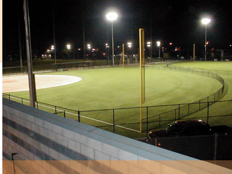
Daytime/Nighttime view of newly completed Softball Field Complex.