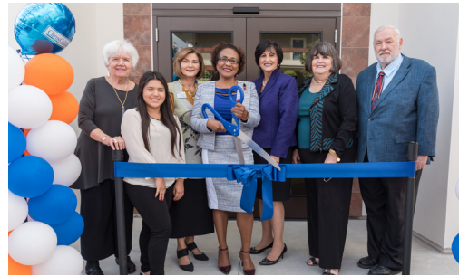
Center for Innovation