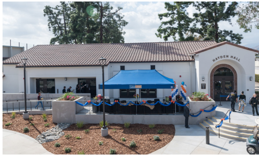
The NEW Hayden Hall

State-of-the-art facilities, such as the new Hayden Hall, now house some of Citrus College's most successful and rapidly expanding programs. As Citrus College continues to improve its infrastructure, the opportunities for greater student success will undoubtedly increase. A quick review of the following Measure G projects offers a glimpse into the future of your community's college.