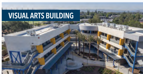
VISUAL ARTS BUILDING