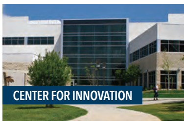
CENTER FOR INNOVATION