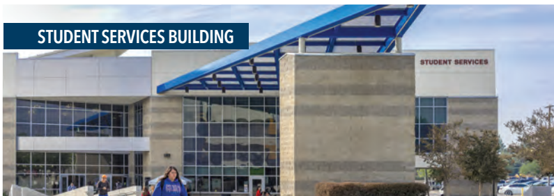
STUDENT SERVICES BUILDING