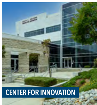
CENTER FOR INNOVATION