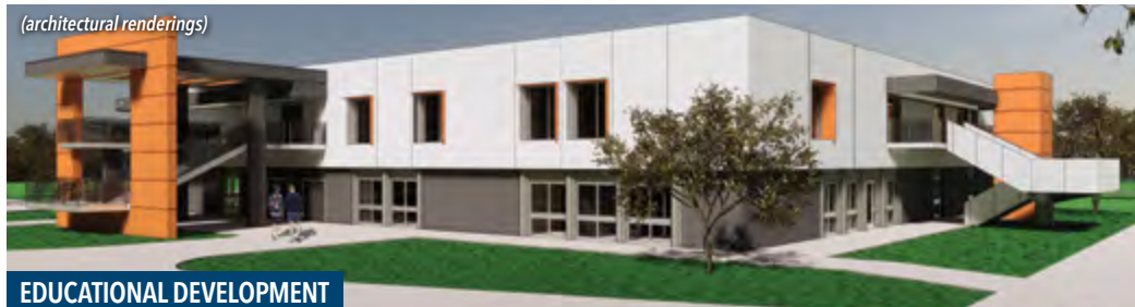
EDUCATIONAL DEVELOPMENT CENTER