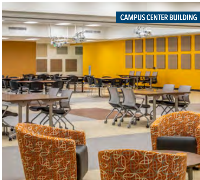
CAMPUS CENTER BUILDING